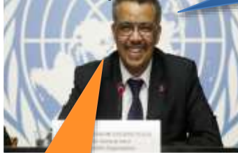
Dr. Tedros Adhanom Ghebreyesus

All roads lead to universal health coverage